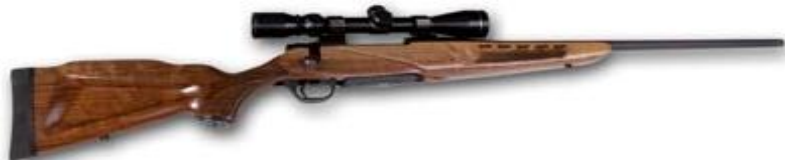
Mossberg 4x4 7mm Mag Rifle

***Guns subject to change based on availability and attendance at the event. More people = more guns.