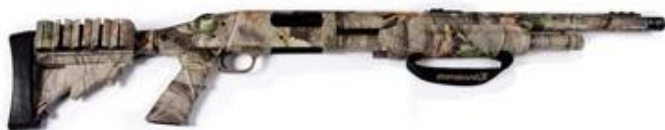
Mossberg 500 Tactical 12ga Shotgun